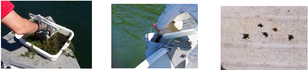
Figure 2: Pictures show (left) Ponar sediment sample, (middle) sieve separation of sediment, and (right) turions collected.

This analysis was conducted to establish baseline turion data that can be used to compare future turion density data to evaluate long-term changes (reduction) in CLP in both lakes. The basis for using this data to evaluate long-term reduction is the method in which CLP reproduces. Turions are produced on mature plants. When the plant dies off (senesce), the turions settle into the sediment and germinate into new plants in the fall/winter. If CLP plants are harvested, some of the turions attached to the plants will be removed as well. If this occurs within a harvest bed during several harvest seasons, it is possible that the turion density could decrease and potentially the CLP plant density could decrease. Measuring plant density within beds after harvest is variable and difficult to time since harvest is occurring continuously. Therefore plant density is not a good representation of long-term progress where turion density can be used.